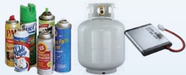
UNACCEPTABLE METAL Aerosol Cans, Propane Tanks, Paint Cans