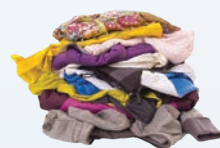
CLOTHING Clothes, Shoes, Boots, Hats, Blankets