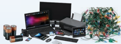
ELECTRONIC WASTE Electronics, Cords, Batteries, Christmas Lights