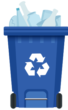
BOTTLES & JARS

NEWSPAPER, OFFICE PAPER, PAPER BAGS, JUNK MAIL, PAPERBOARD, MAGAZINES