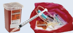
MEDICAL WASTE, SYRINGES