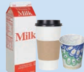
PLASTIC COATED FIBER