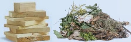
WOOD ITEMS, YARD WASTE